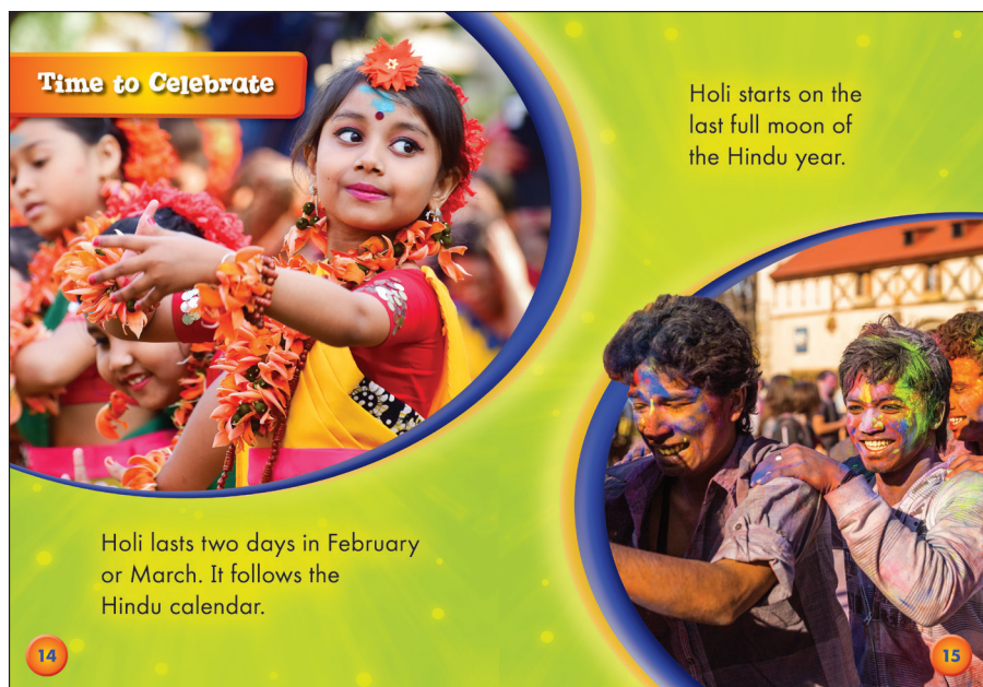
Sample spread from Holi